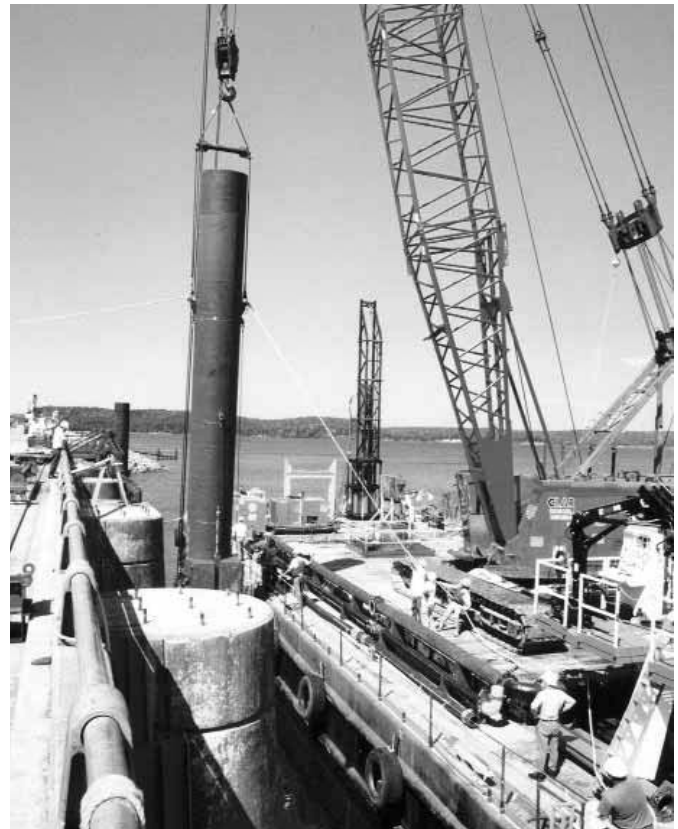
Workers use a barge-mounted crane to place the first of 469 54-inch-diameter casings for construction of the concrete secant wall in front of Walter F. George Dam. The wall is an average distance of 10 feet in front of the dam.