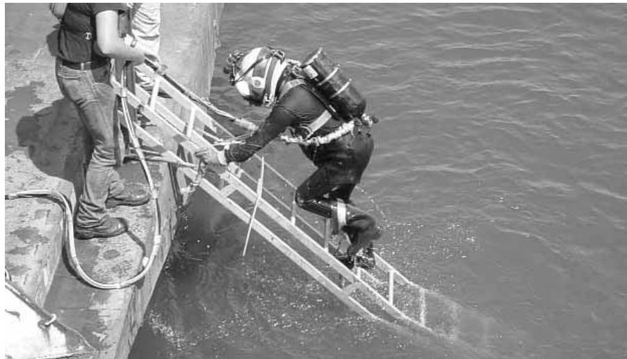
Divers made more than 150 dives to remove a steel coffer cell and other obstructions during construction of the cutoff wall in front of Water F. George Dam. Divers also assisted the project with construction and inspections.

During this drilling, the contractor dis-